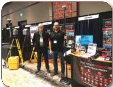
EXHIBIT HALL LAYOUT